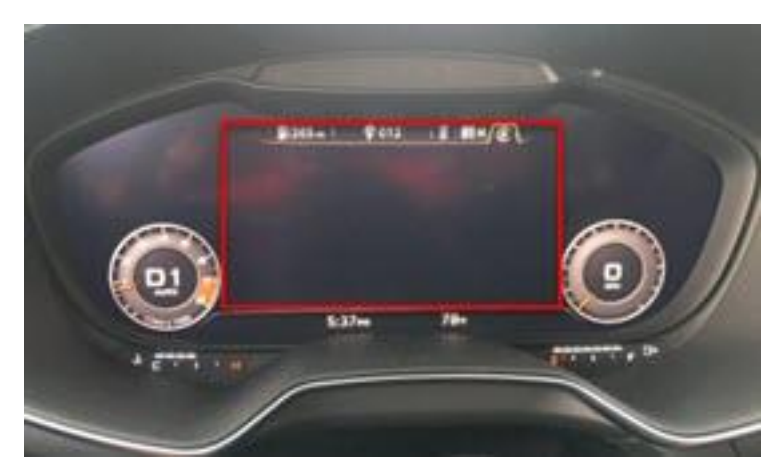
Figure 1. FPK screen is blank.