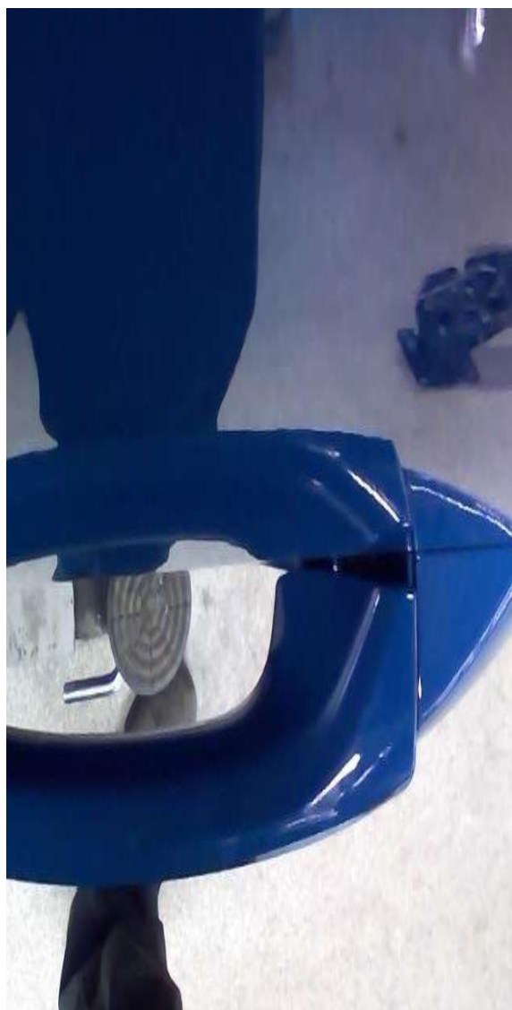
Figure 1. Door handle binding and not returning to zero position.