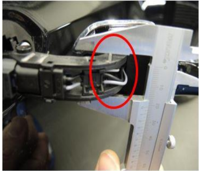
Figure 4. Measuring dimension of a door handle at rib #3.