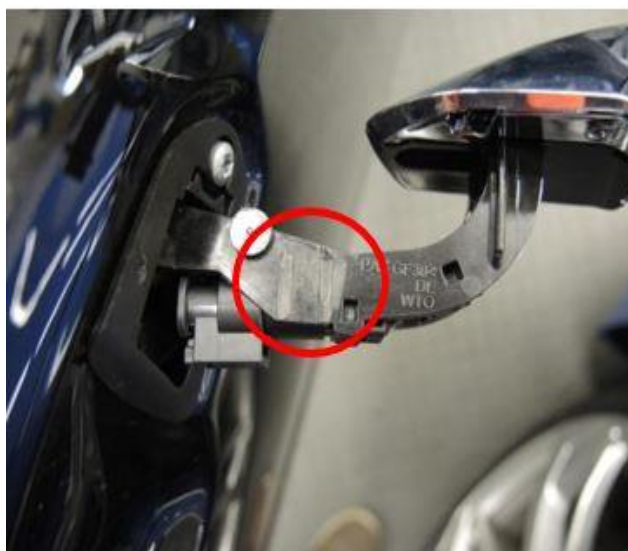
Figure 3. The door handle is shown with #1 and #2 ribs removed, leaving an even surface.