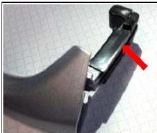
Figure 6. The door handle guide piece to be replaced.