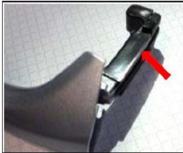
Figure 6. Door handle guide piece to be replaced.