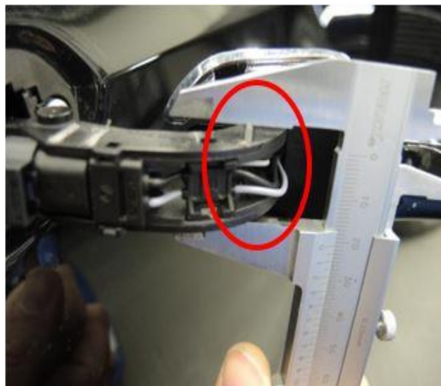
Figure 4. Measuring dimension of door handle at rib #3.