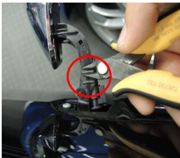
Figure 2. #1 and #2 door handle ribs prior to removal.