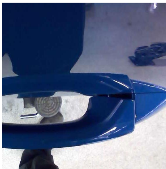
Figure 1. Door handle binding and not returning to zero position.