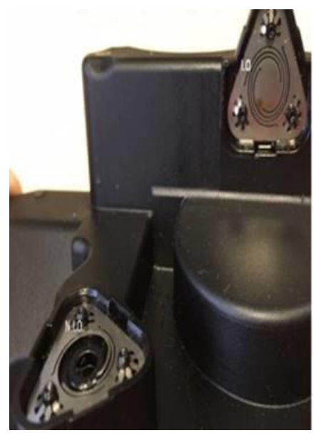
Figure 1. Metal plates.

If one plate is defective then always replace both (included in the pressure regulating valve repair kit).