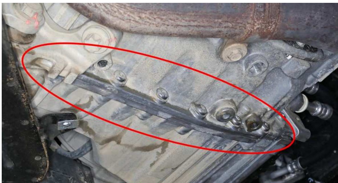
Fig. 2 (Reference Picture) Potential Leak Area at Case Split