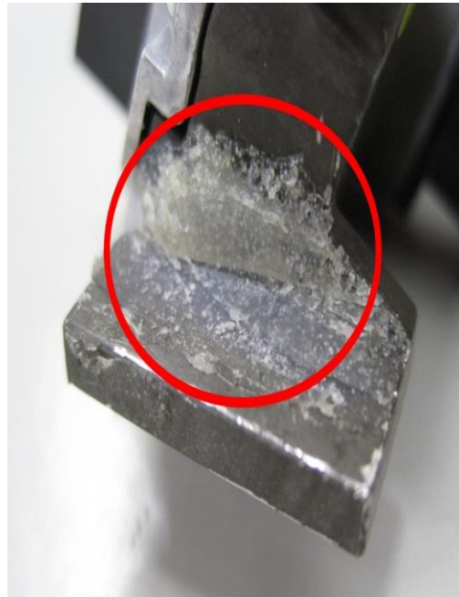
Figure 1. Cleaning of the camera.

Tip: Protect the front camera against damage when removing the adhesive residues.