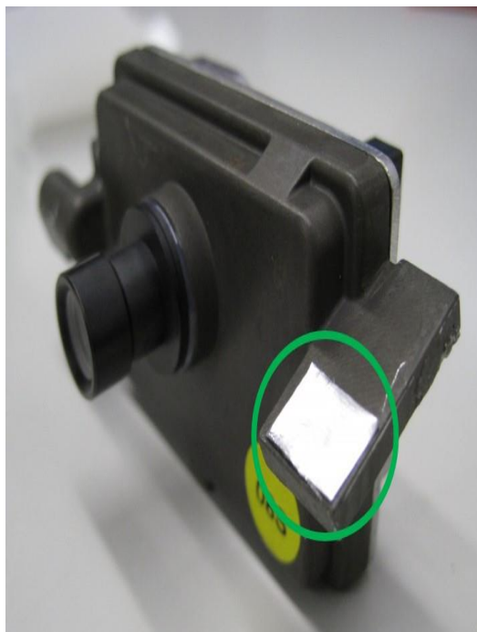
Figure 2. Placement of decal.