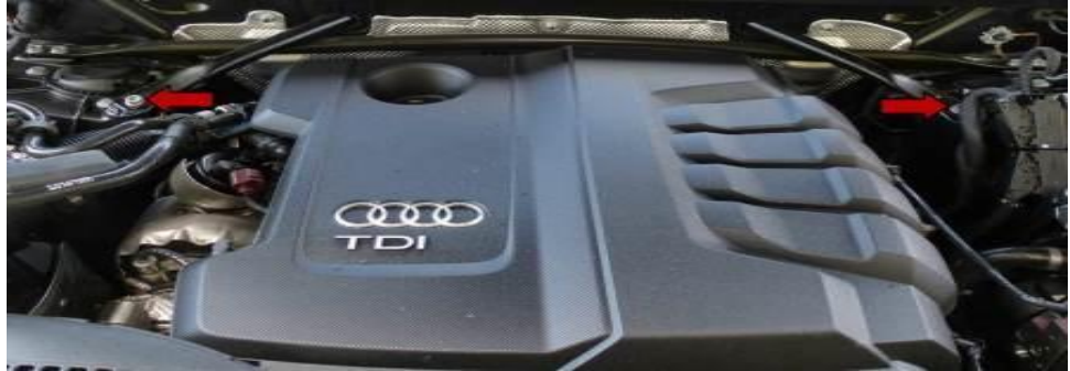
Figure 1. Example of tower brace for an Audi Q7.

2. If necessary, secure the bolt with the correct torque according to the repair manual and reassess the concern (Figure 1 and 2).