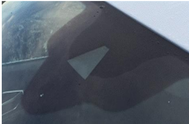
Figure 1. Viewing area fogged up from outside.

The viewing area of the front camera can be fogged up both on the inside and/or on the outside (Figure 1 and 2).