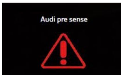
Figure 1. Audi pre sense symbol.

The Audi pre sense symbol appears in the instrument cluster and an audible warning is issued at the same time (Figure 1). At the same time, neither of the blinkers was active nor the side window closed.