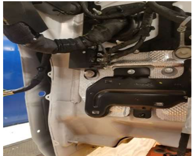
Fig 1, PCR relay location below PDC

This document does not authorize warranty repairs. This communication documents a record of past experiences. STAR Online does not provide any conclusions about what is wrong with the vehicle. Rather, it captures all previous cases known that appear to be similar or related to the vehicle symptom / condition. You are the expert, and you are responsible for deciding on the appropriate course of action.