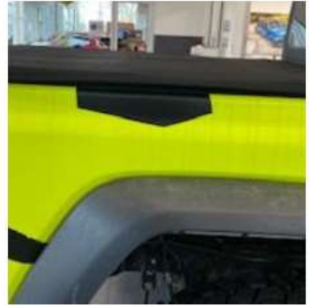
Normal Condition After Unrolling – Some Waviness at Edges of Bows

This document does not authorize warranty repairs. This communication documents a record of past experiences. STAR Online does not provide any conclusions about what is wrong with the vehicle. Rather, it captures all previous cases known that appear to be similar or related to the vehicle symptom / condition. You are the expert, and you are responsible for deciding on the appropriate course of action.