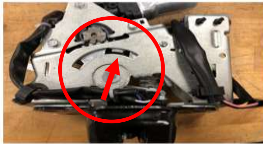
Figure 2 – Latch is in Home position

Once the latch position is verified and while the vehicle has power, cycle the vehicles' outside liftgate handle three times slowly. Check if the latch sector gear moved back to Home Position (Figure 2). If not, unplug the main connector between the latch and the body wire harness (Figure 3) for 10 seconds and then plug it back in. Check if the latch sector gear moved back to Home position. If the latch is at Home position, press the vehicle's inside liftgate button. If the liftgate functions properly, clear the DTCs.