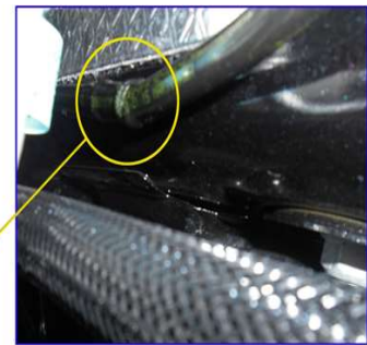
Review hose routing at the left shock tower.

Contact the STAR Center for assistance if no solution is found