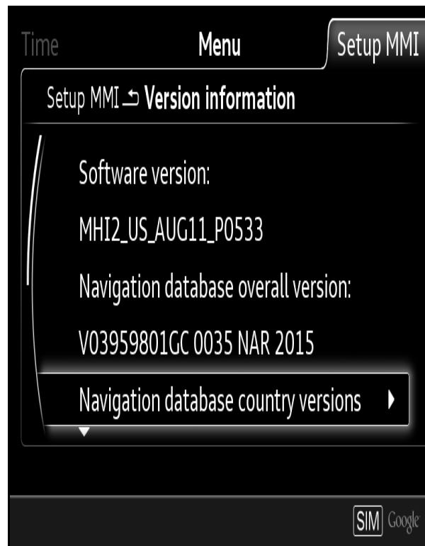
Figure 2. MMI Version Information.