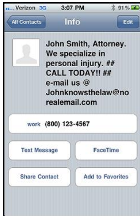
Figure 2. Example of an incorrectly saved name field that contains incorrect characters.