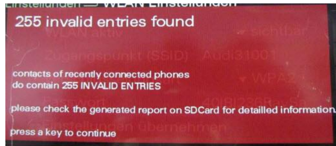
Figure 5. Specific issues were detected with the phonebook contact entries.