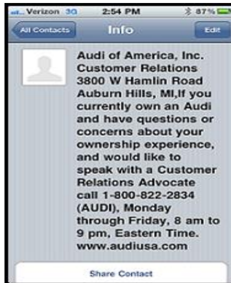
Figure 1. Example of an incorrectly saved name field that exceeds 40 letters and contains numbers and a URL.