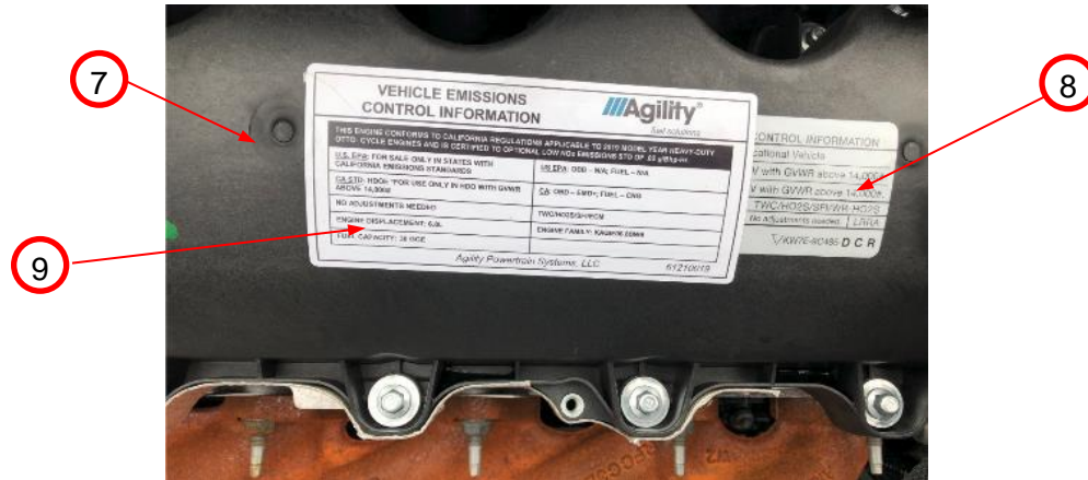
Figure 5: Passenger Valve Cover (7), OEM VECI Label (8), Agility VECI Label (9)