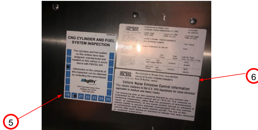
Figure 4: Original Inspection Decal (5), Morgan Olson build label (6).