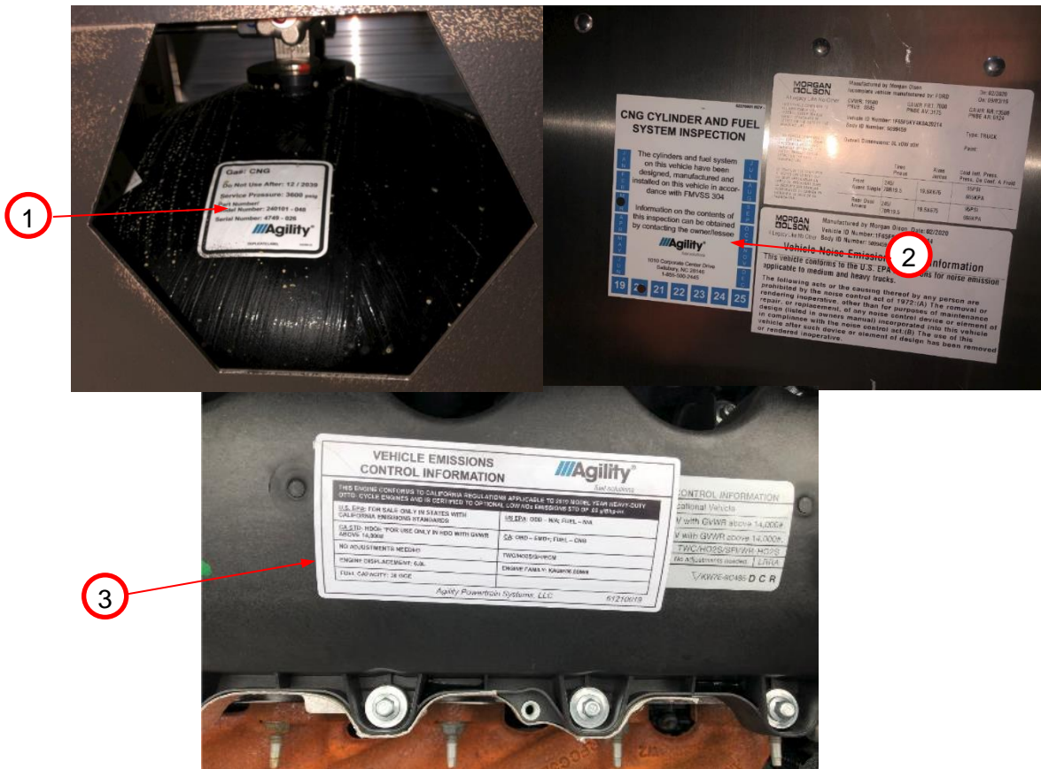
Figure 1 Cylinder Sticker (1), Original Inspection Decal (2), VECI Label (3)

The Agility service team has identified certain Package Trucks built on the Ford F59 chassis, powered by the Ford V10 with Agility CNG system, that did not have all the decals and stickers installed properly prior to delivery of the units. These units will need to have the labels installed as detailed in this publication.