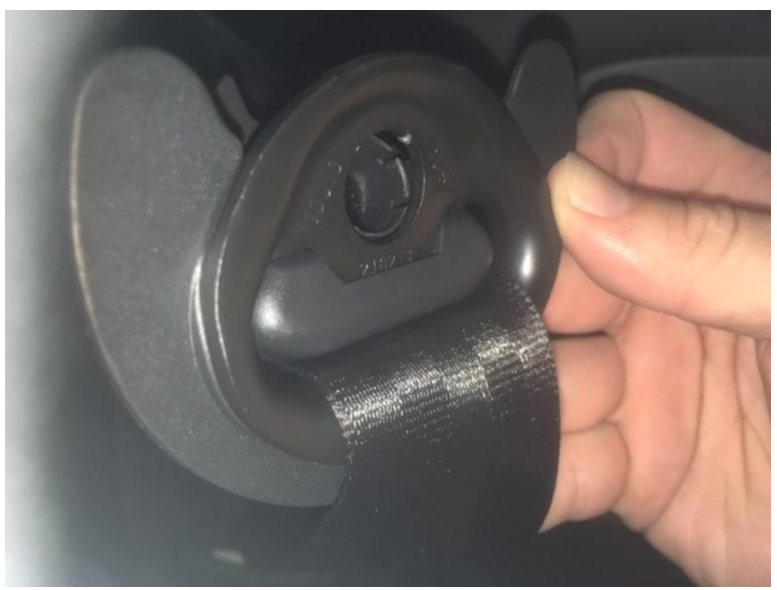
Figure 3. Removing old seat belt guide starting at the bolt hole.