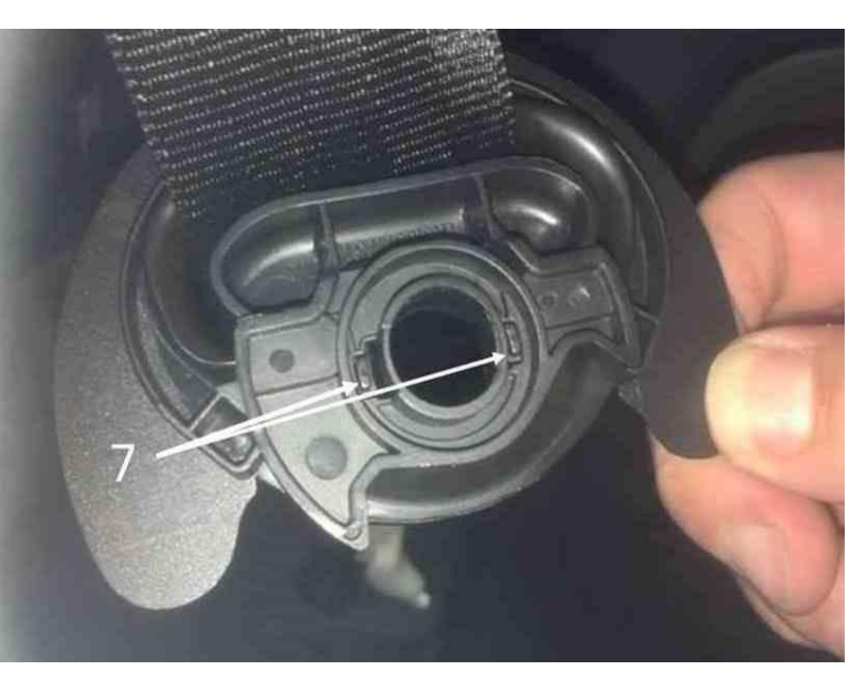
Figure 8. Seat belt deflector trim locking tabs properly secured to seat belt guide.

9. Inspect the back of the deflector for proper installation of the deflector trim locking tabs to seat belt guide (Figure 8, Pos. 7)