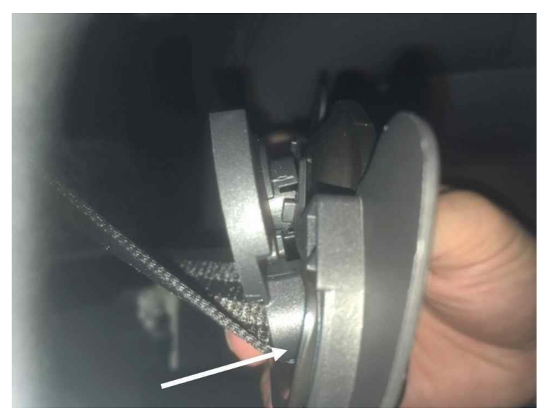
Figure 5. Installing modified seat belt guide starting with the metal tab on the bottom.