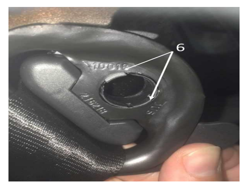
Figure 7. Belt guide locking tabs correctly secured at bolt hole.