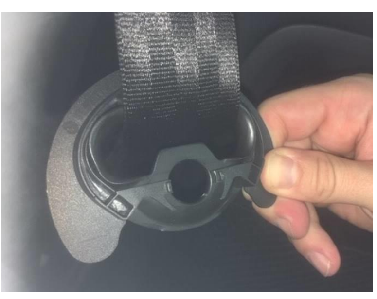
Figure 4. Old seat belt guide removed. Seat belt twist corrected.

4. With the old belt guide removed, turn the seat belt webbing to remove the twist (Figure 4).