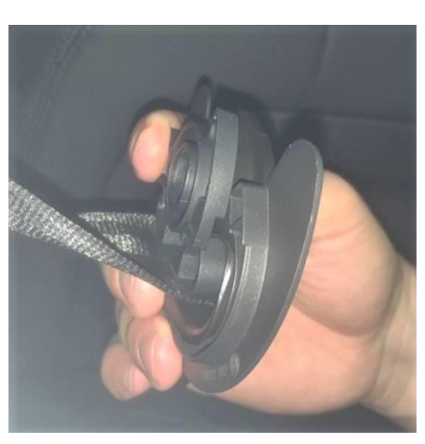
Figure 6. Seat belt deflector with new guide installed.

Inspect the front of the deflector for proper installation of the guide locking tabs at the bolt hole (Figure