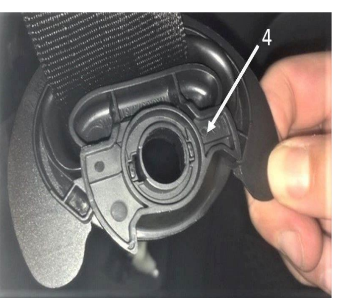
Figure 2. Backside of seat belt deflector. Deflector trim tabs engaged in old belt guide.

Do not use sharp objects to remove the old belt guide to avoid damaging the seat belt webbing.