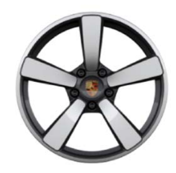
Carrera Exclusive Design

FA: 8.5J x 20, RO 53 (summer) Part No. 992.601.025.K_FFF