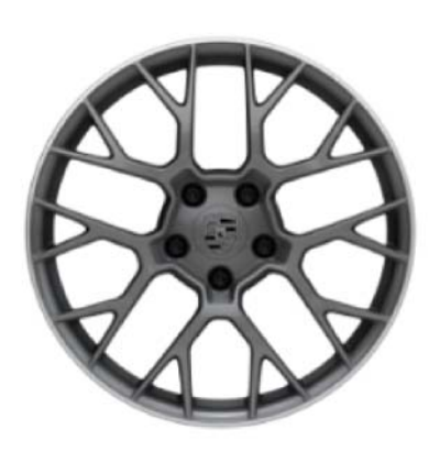
RS Spyder Design 2

RA: 11.5J x 21, RO 67 (summer) Part No. 992.601.025.G_FFF