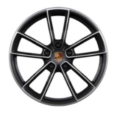
Carrera Classic 3

RA: 11.5J x 21, RO 67 (summer) Part No. 992.601.025.J_FFF