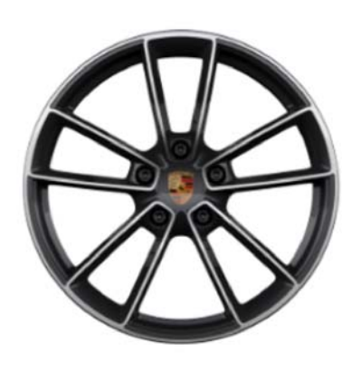
Carrera Classic 3

FA: 8.5J x 20, RO 53 (summer) Part No. 992.601.025.H_FFF