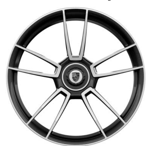
Turbo S 4