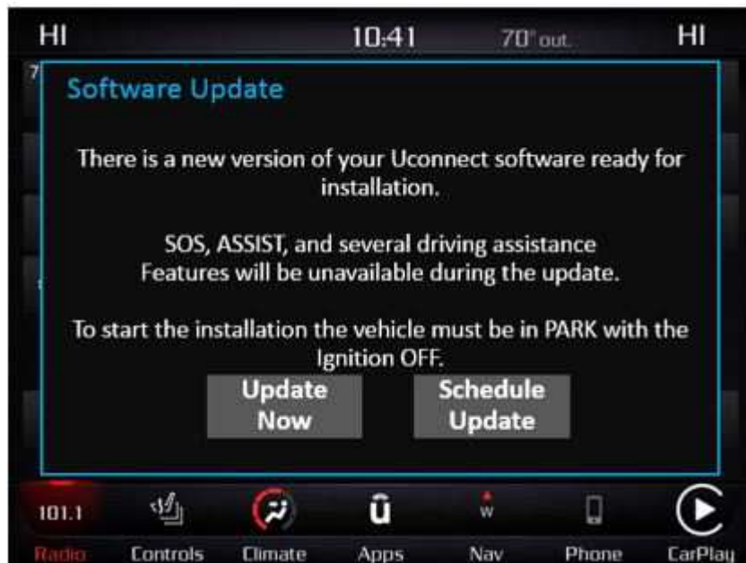
Fig. 1 Software Acceptance Screen

Vehicles sold in the U.S. and Canada can now receive software updates "over-the-air". Updates to software will occur in a phased roll-out. The software is updated through the built-in cellular modem in the radio. Customers will see a notification on their radio screen when new software is available for their radio (Fig. 1). The owner will have the option to update the radio or schedule the update for later. There is not an option to decline the update indefinitely, the update must be performed.