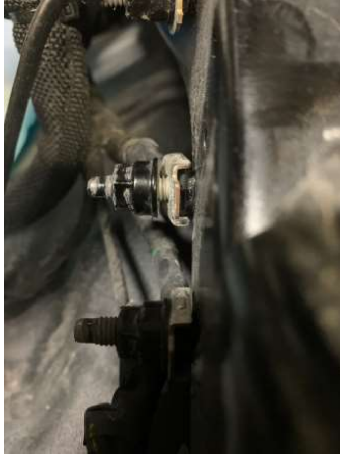
Loose G909B Ground Stud Nut

Repair: Clean and tighten the G909B ground to secure the connection.