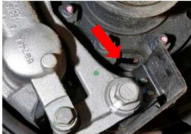
Fig. 1 Support Plate Access Hole