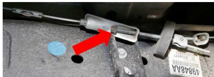
Fig. 2 Cable Tensioner Adjusting Nut