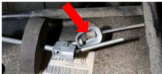
Fig. 4 Left Hand Parking Brake Cable End