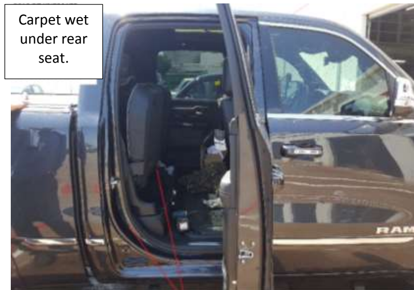
Inspection area for water entry rear cabin wall.

Sunroof drain tubes, connections and grommets should be inspected for kinks, and proper attachment for all 4 tubes.