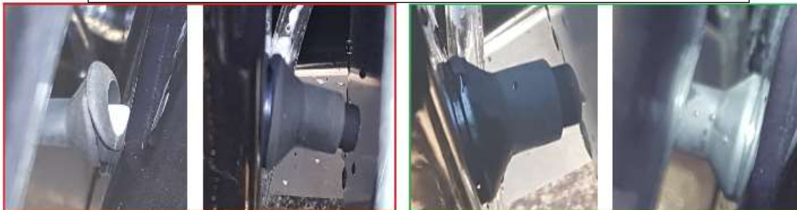
SUNROOF REAR DRAIN GROMMETS NOT INSTALLED IN BODY, WATER LEAK INTO CAB