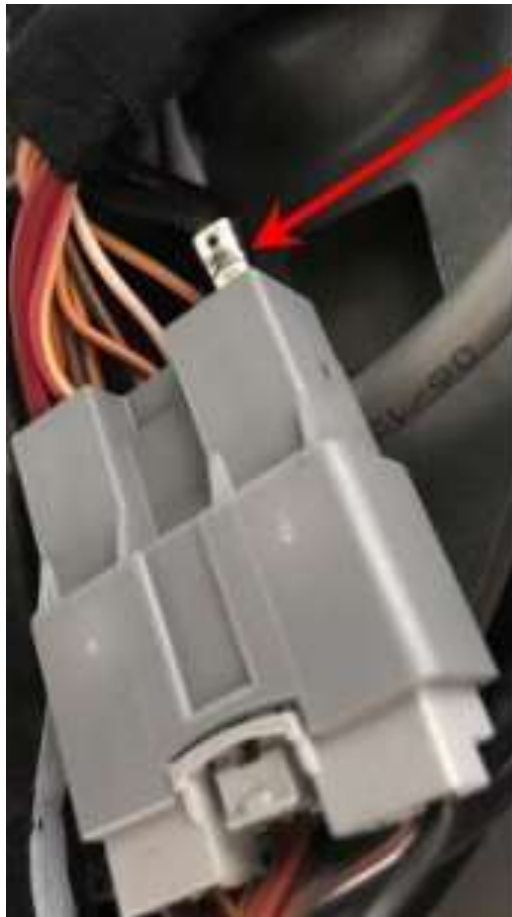
Z911 – Black