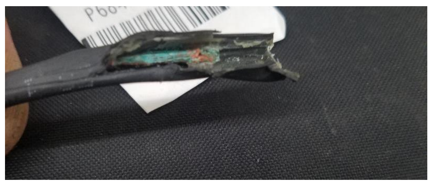
Corroded Splice SD403

Repair: Clean and repair the circuits using standard procedures. Make sure to utilize heat shrink in your repair to protect the splice from future corrosion.