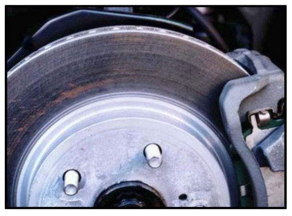
Figure 1. Slight Rust on Rotor (Easy to Remove by Braking)