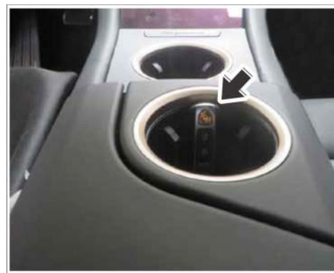
Emergency start tray