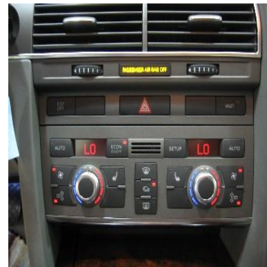
Figure 1. Climate control settings.