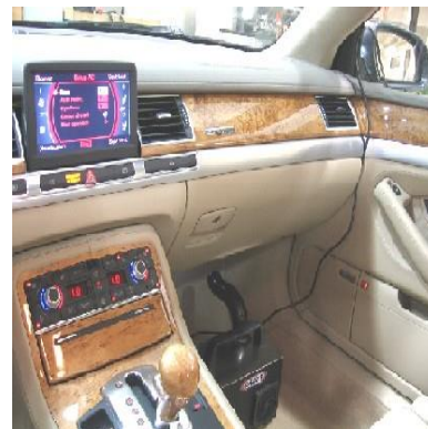
Figure 4. The window is slightly open so that the cord can pass through.