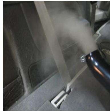
Figure 5. Correct positioning of the outlet tube on a Q7.