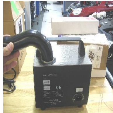
Figure 3. The connected outlet tube.