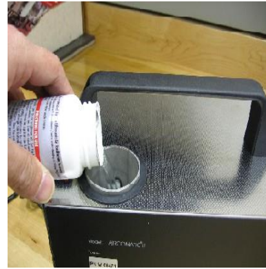
Figure 2. Pouring the treatment into the filling chamber.