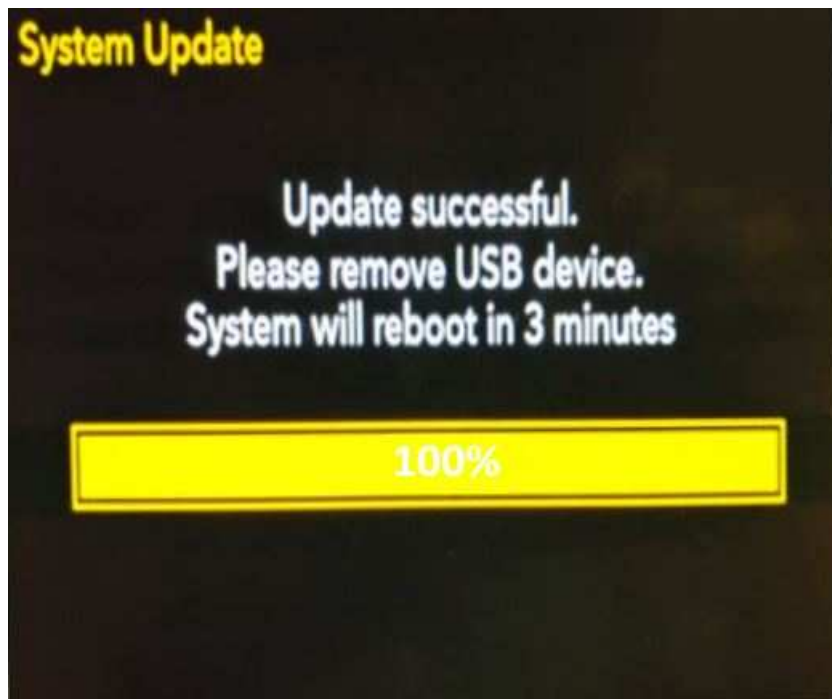
Fig. 3 Update Successful Screen

10. After the update is done the screen will display "Update successful" see (Fig. 3) .