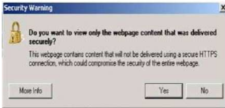
Fig. 1 Pop-up Security Message

NOTE: A blank USB flash drive must be used to download the software. Only one software update can be used on one USB flash drive.