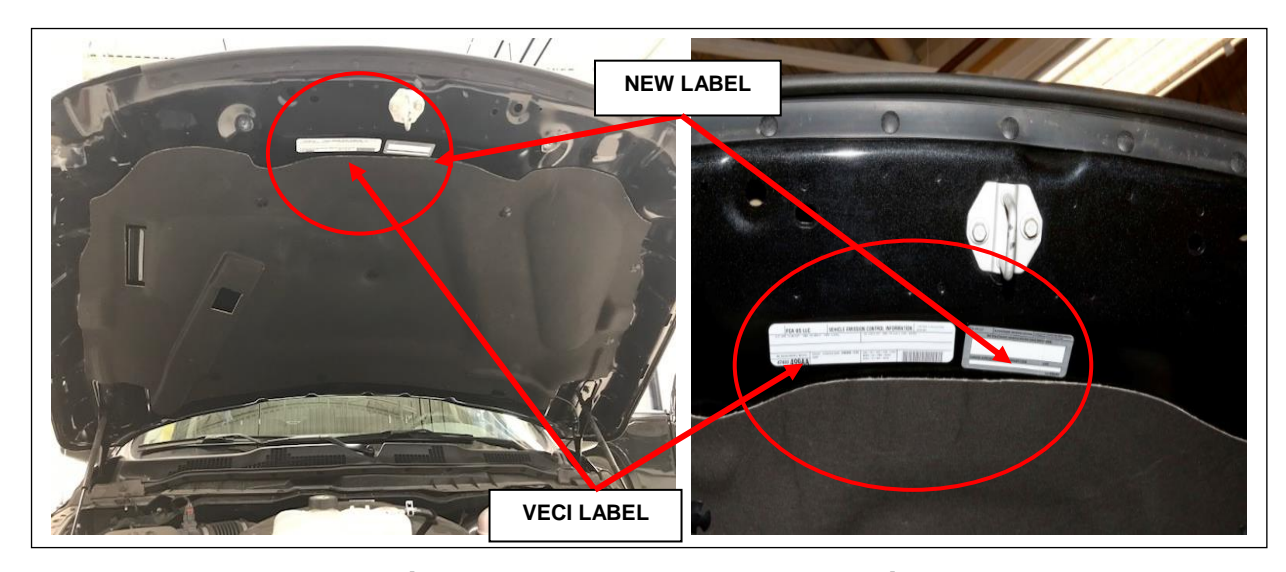
Figure 4 – RAM 1500 Label Location