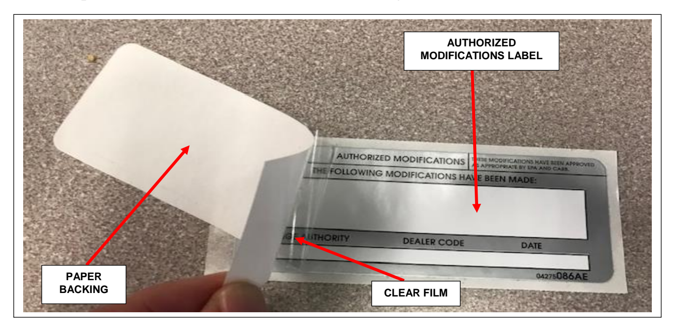
Figure 2 – Remove Backing from the Clear Film

44. Remove the paper backing from the clear film on the front of the Authorized Modifications Label then carefully apply the clear film over the front of the completed Authorized Modifications Label (Figure 2).