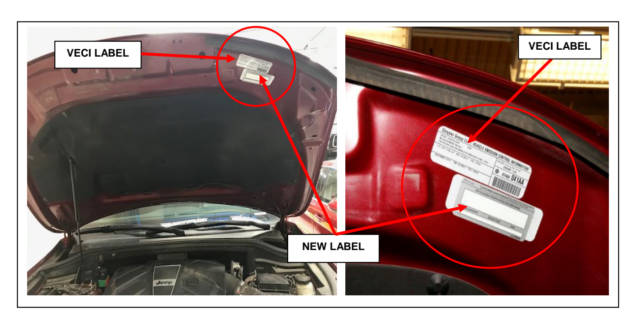
Figure 3 – Jeep Grand Cherokee Label Location