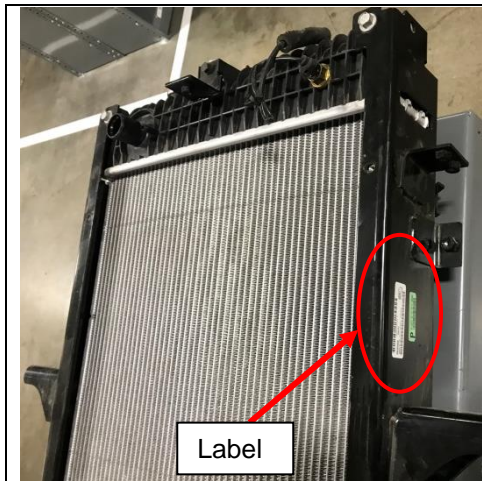
Figure 1- Manufacturer Label Location.