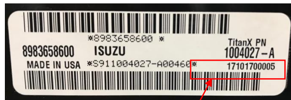
Figure 2 – Manufacturer Label