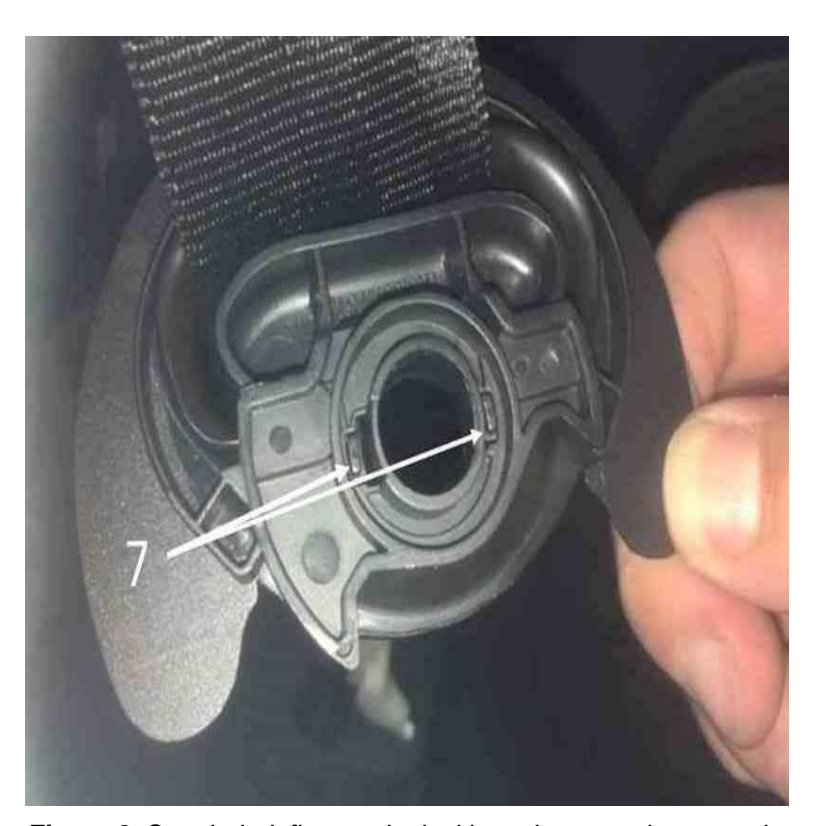
Figure 8. Seat belt deflector trim locking tabs properly secured to seat belt quide.

Inspect the back of the deflector for proper installation of the deflector trim locking tabs to seat belt guide (Figure 8, Pos. 7)