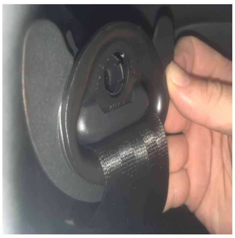
Figure 3. Removing old seat belt guide starting at the bolt hole.