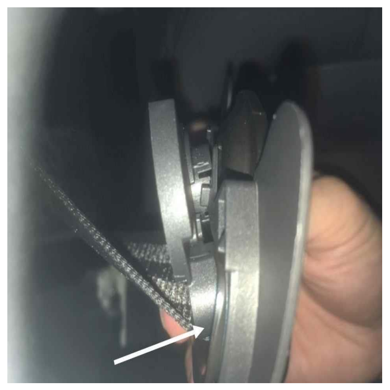
Figure 5. Installing modified seat belt guide starting with the metal tab on the bottom.

6. Start installing the modified seat belt guide at the deflector metal tab (Figure 5).