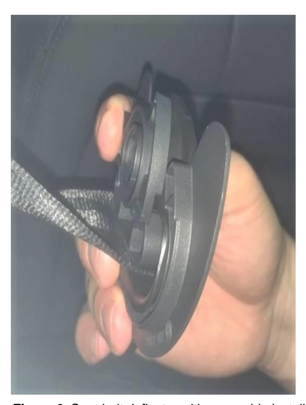
Figure 6. Seat belt deflector with new guide installed.

Push the new guide into the bolt hole until you can hear the plastic retainers snap into place (Figure 6).