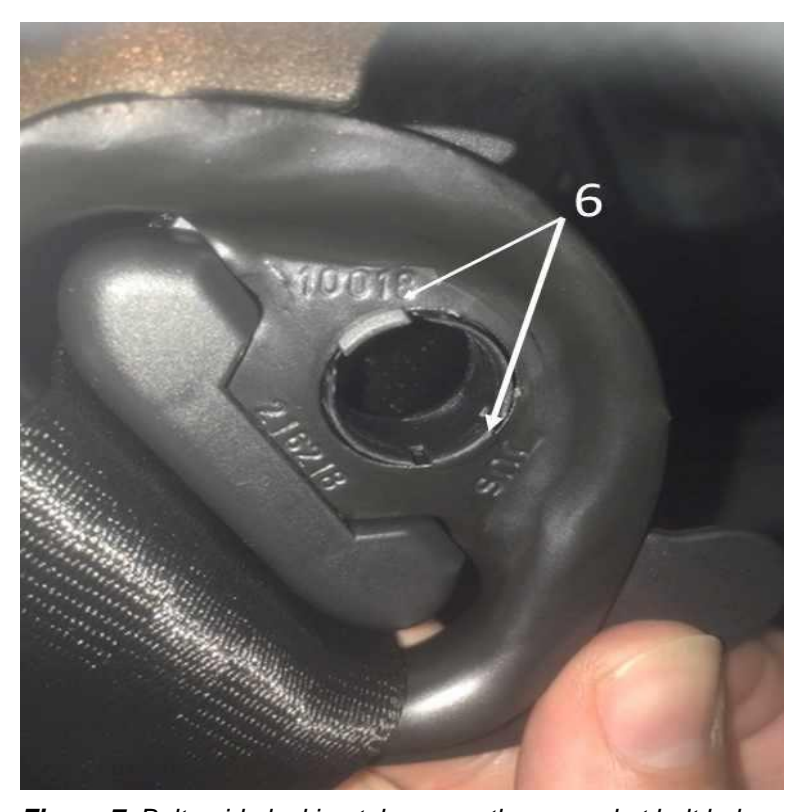
Figure 7. Belt guide locking tabs correctly secured at bolt hole.

8. Inspect the front of the deflector for proper installation of the guide locking tabs at the bolt hole (Figure 7, Pos. 6)