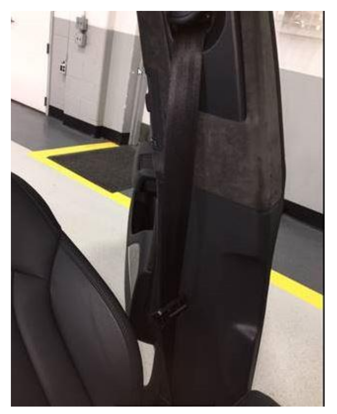
Figure 9. Example of a twisted seat belt.

The twist that is within the seat belt assembly can be removed without any disassembly of the B pillar trim on either side of the vehicle. The pictures below show the twist and how it could look (Figure 9 and 10).