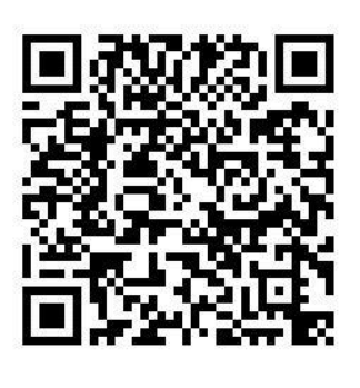
Figure 11. The QR code for supporting video.

To remove the twist from the seat belt assembly, all you need to do is feed a twist in the opposite direction that the seat belt is currently twisted. Please review the audio/video example below: https://audiexternal.kzoplatform.com:44 3/#/player/medium/1384922160346175 460?autoplay=on (Figure 11).