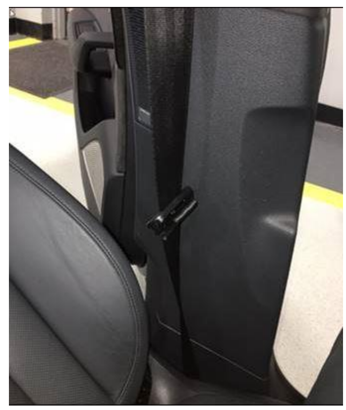
Figure 10. Example of a twisted seat belt.

To remove the twist from the seat belt assembly, all you need to do is feed a twist in the opposite direction that the seat belt is currently twisted. Please review the audio/video example below: https://audiexternal.kzoplatform.com:44 3/#/player/medium/1384922160346175 460?autoplay=on (Figure 11).