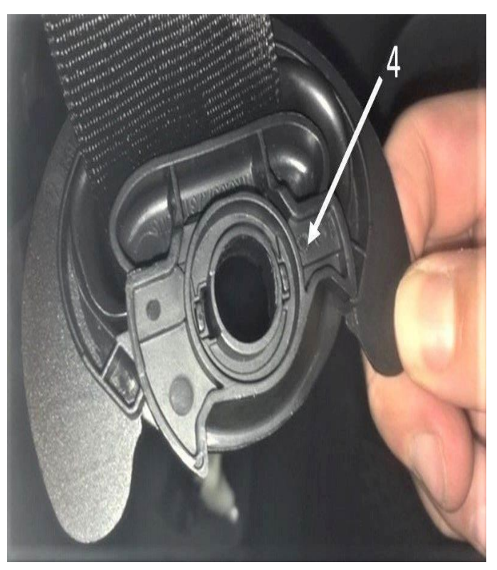
Figure 2. Backside of seat belt deflector. Deflector trim tabs engaged in old belt guide.

Do not use sharp objects to remove the old belt guide to avoid damaging the seat belt webbing.