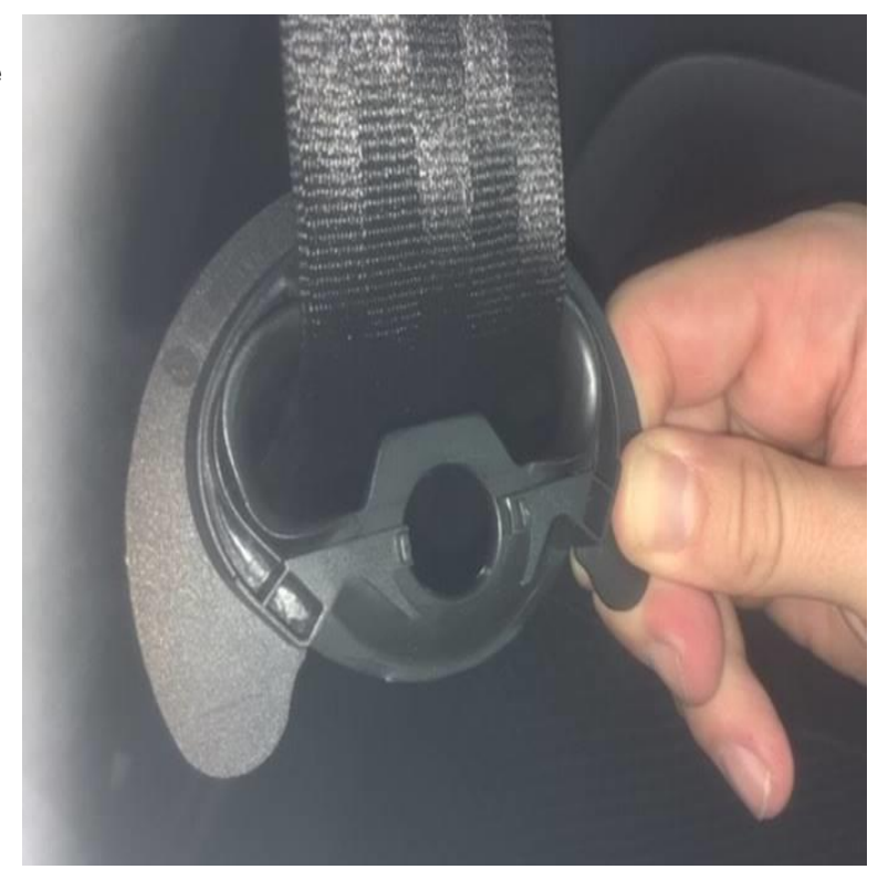
Figure 4. Old seat belt guide removed. Seat belt twist corrected.

4. With the old belt guide removed, turn the seat belt webbing to remove the twist (Figure 4).