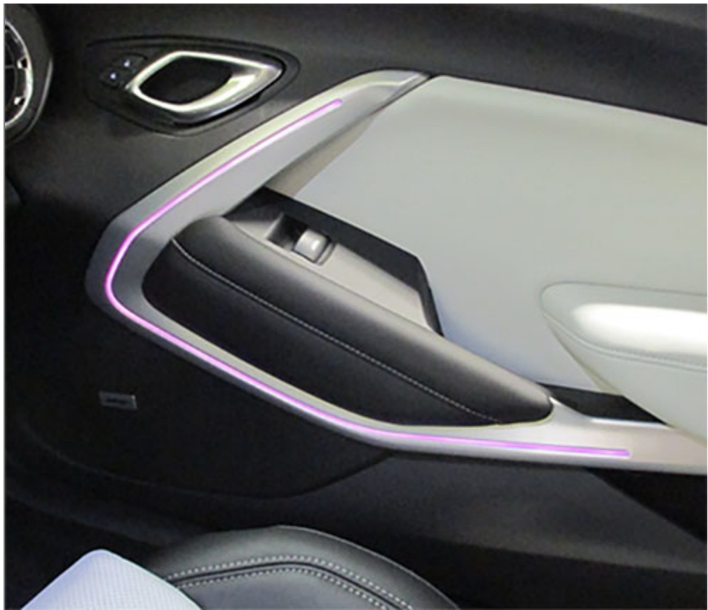
2) Footwell Lighting only