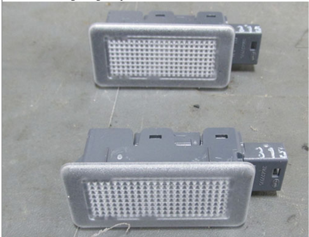
3) Light up Accent Lighting on the door panels AND Footwell Lighting

IMPORTANT: When installing a GM Accessory Lighting Kit, the light strips around the radio display and the center cupholders will NOT illuminate. The only way to get these two lights to operate is to purchase the vehicle with the factory C70 RPO. The radio display and the center cupholder will NOT illuminate with installation of the GM Accessory Lighting Kit.