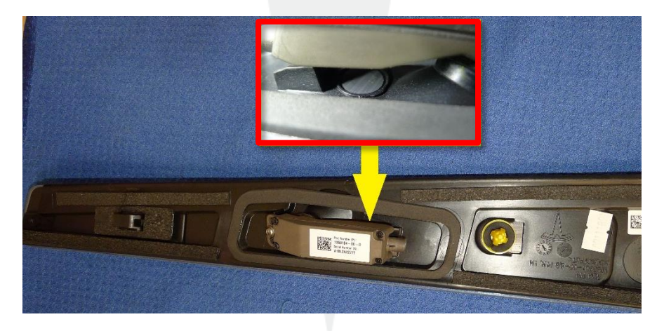
Figure 2 - Model X