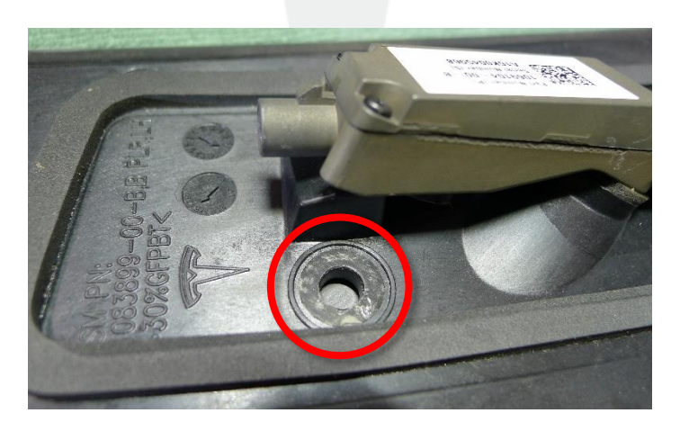
Figure 6 - Model S shown, Model X and Model 3 similar