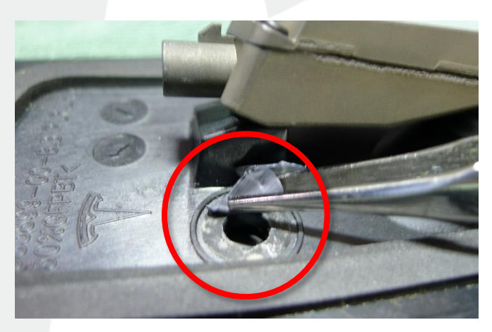
Figure 5 – Model S shown, Model X and Model 3 similar