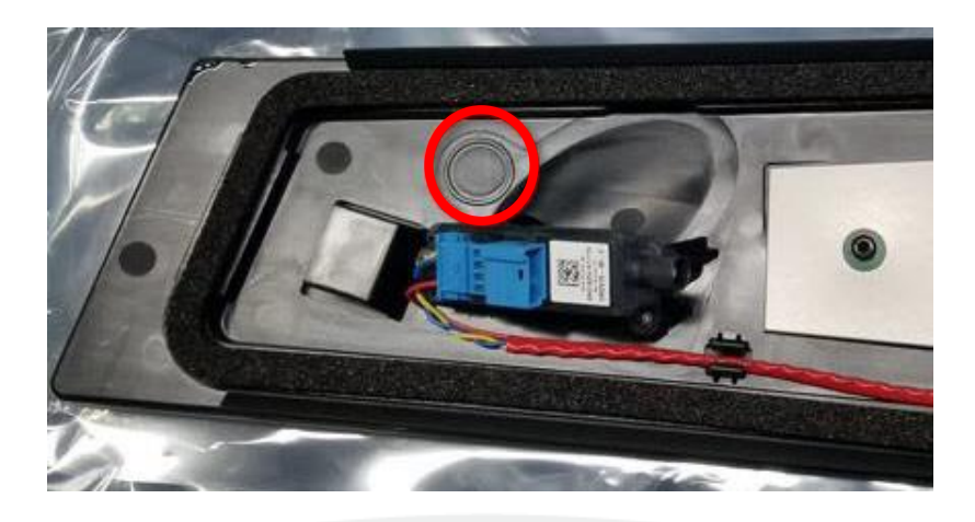
Figure 3 - Model 3