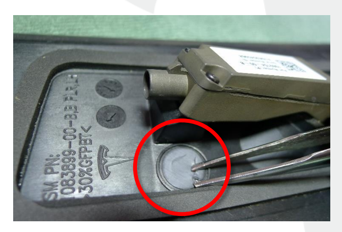
Figure 4 - Model S shown, Model X and Model 3 similar