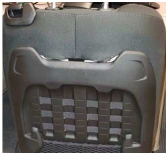
Fig. 1 Gap Between Seat Back and Panel