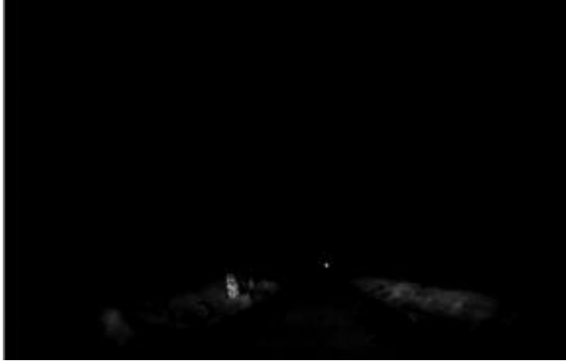
At night with no traffic light