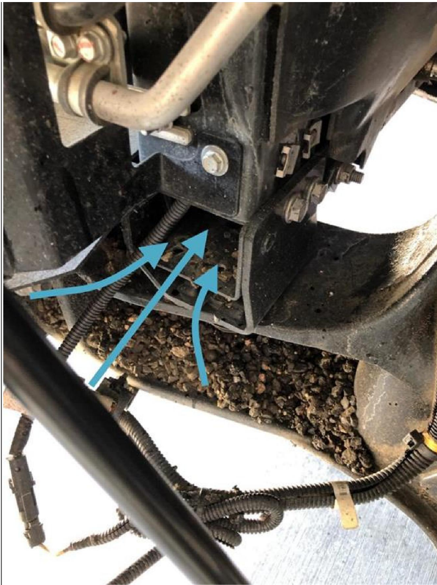
Figure 1: Radiator Opening

During engine fan operation debris can be pulled into the shroud area through this opening.