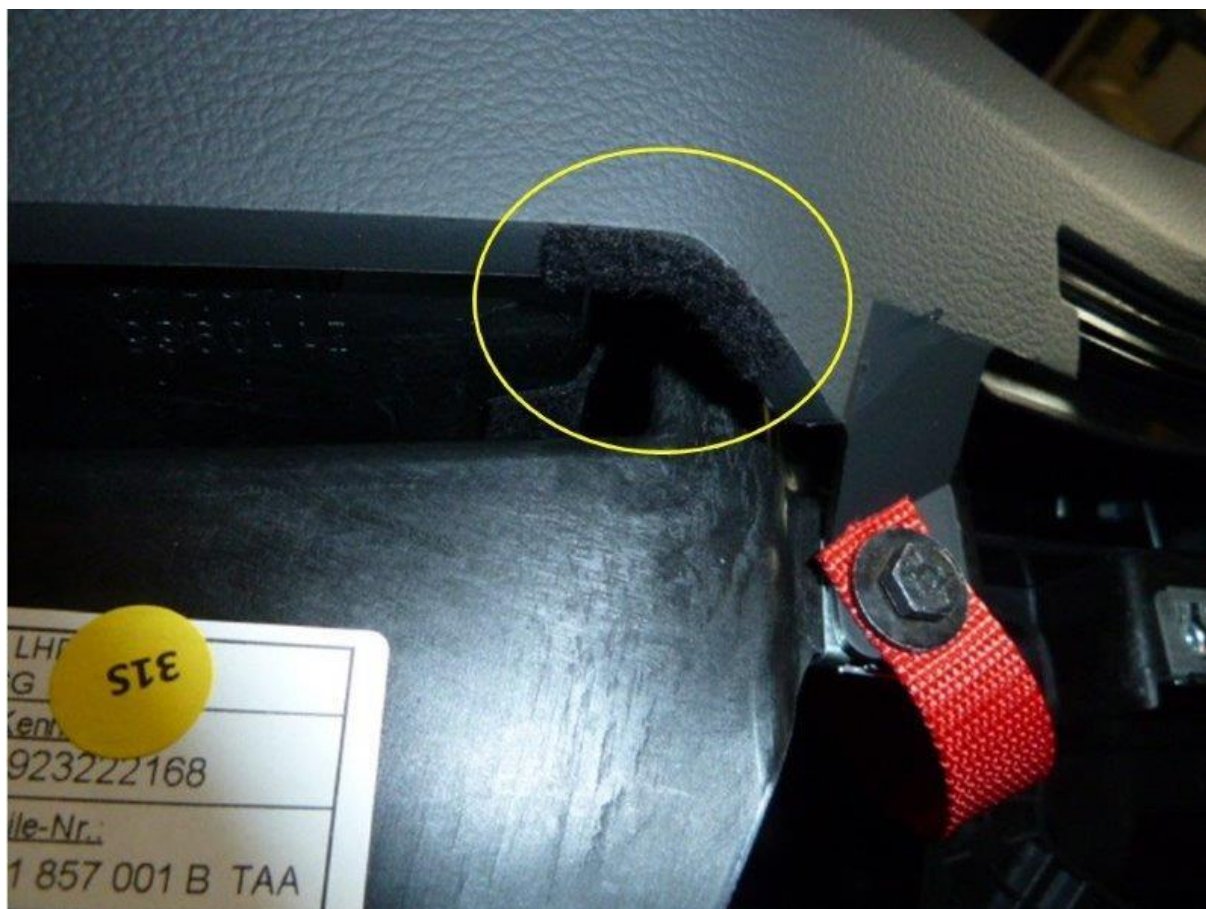
Figure 3. Close up of the right felt strip.