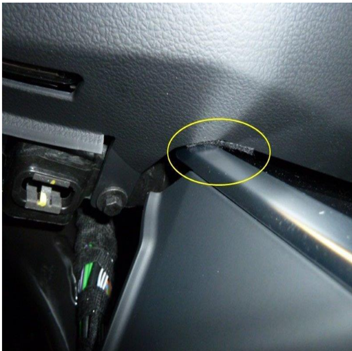
Figure 1. Installation of the felt strip shown (yellow circle).