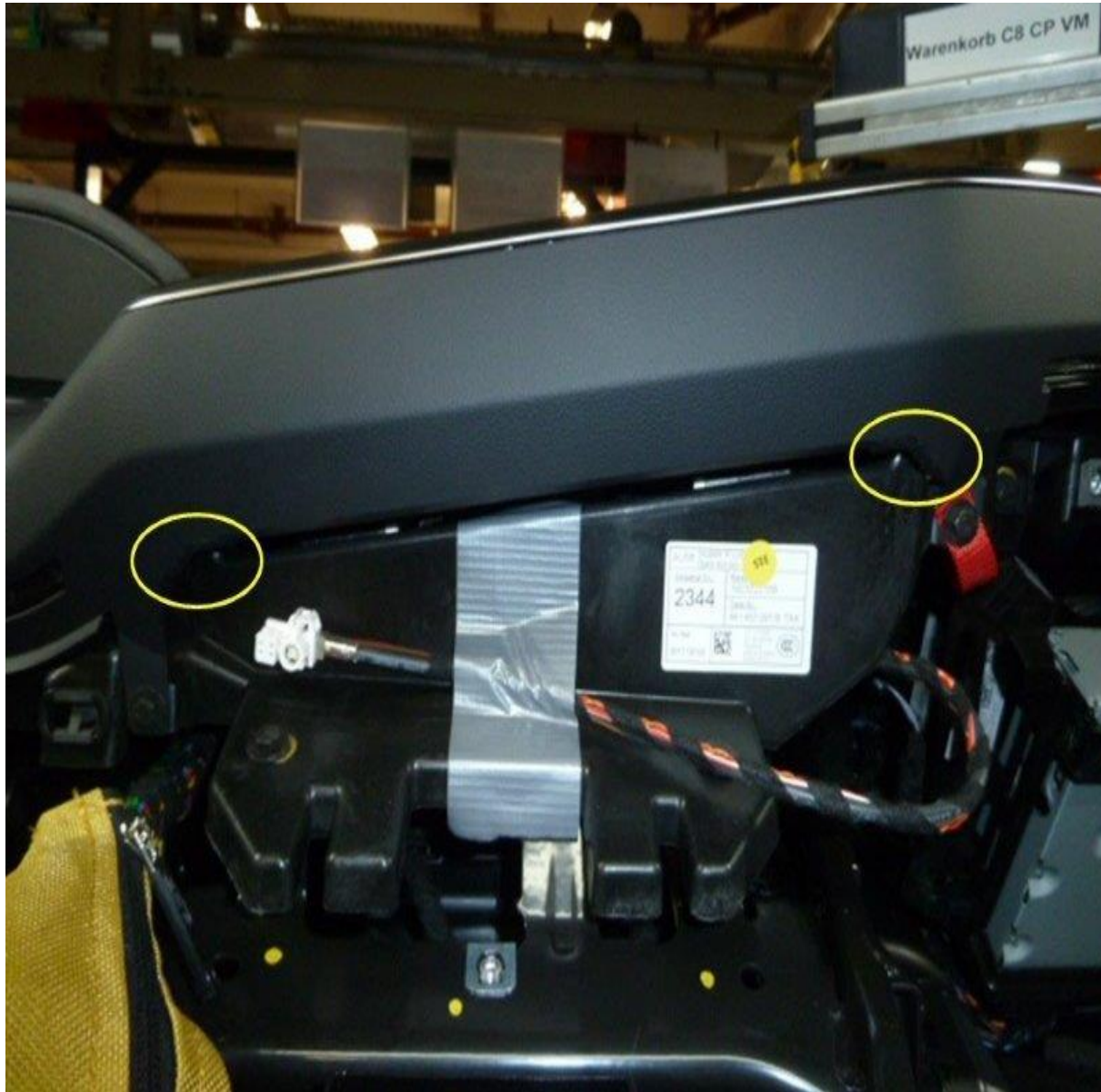
Figure 2. Positions of the felt strips (yellow circles).