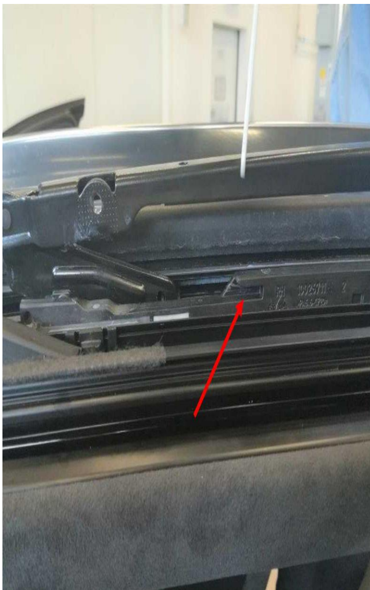
Figure 5. The groove in the slide and tilt mechanism.