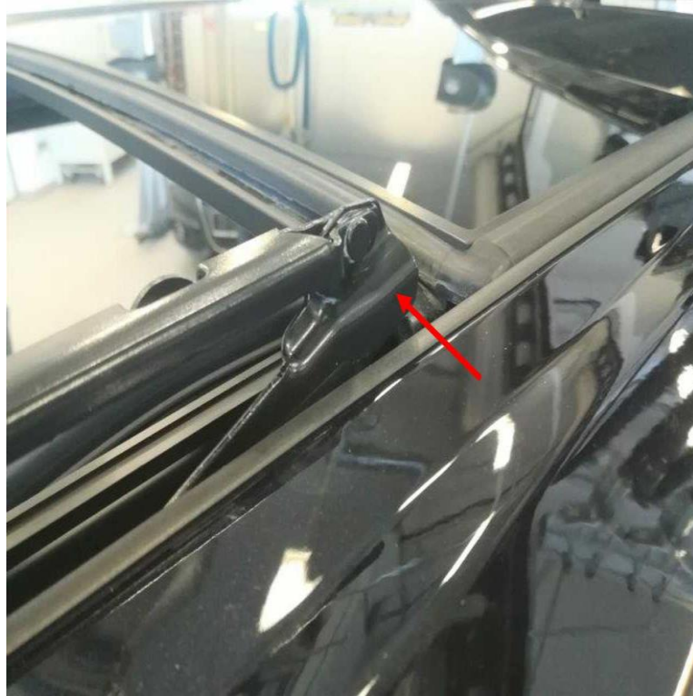
Figure 7. Section of slide and tilt mechanism to be lubricated.