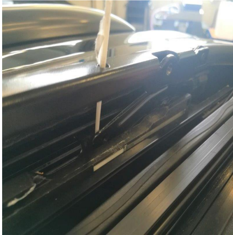
Figure 10. Close up view of the lubrication of the channel under the arm of the slide and tilt mechanism.