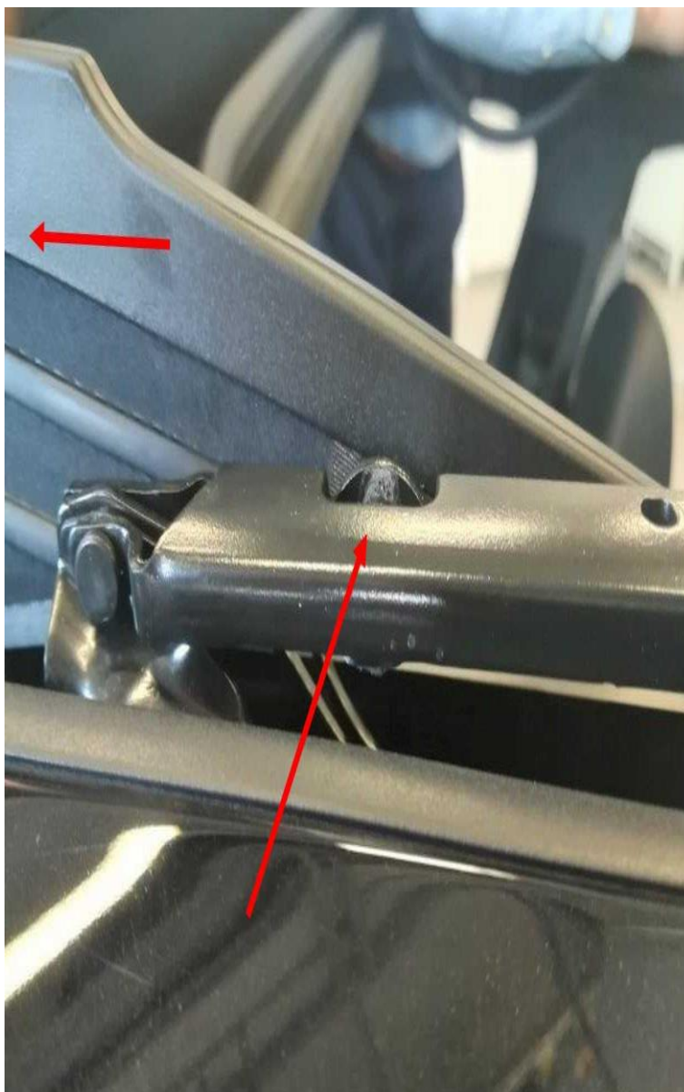
Figure 3. The left side of the slide and tilt mechanism.