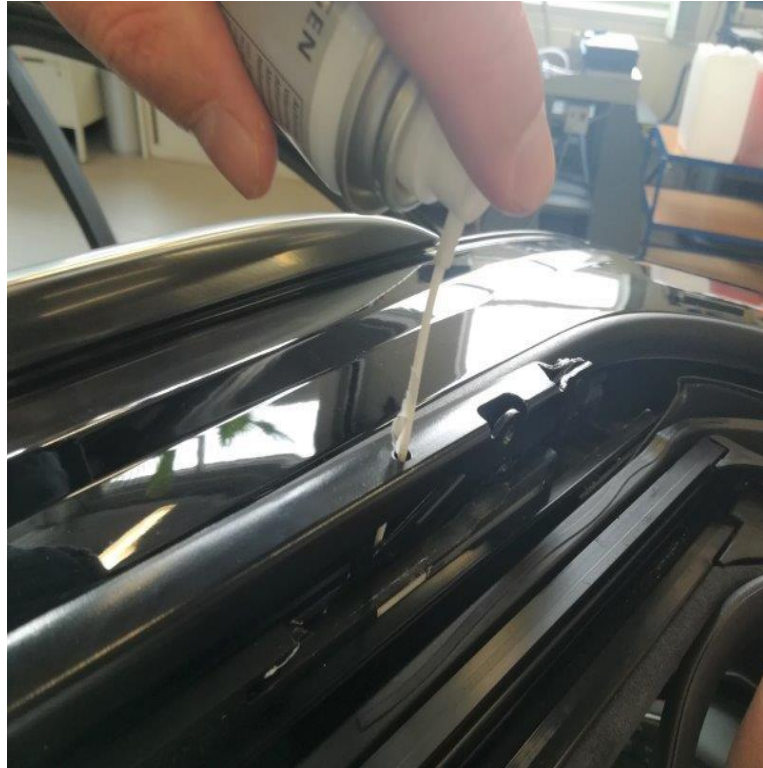
Figure 9. Accessing the channel through the arm of the slide and tilt mechanism.