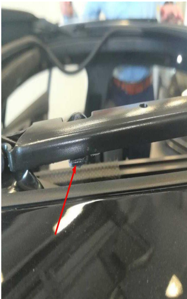
Figure 4. Lug to be lubricated on slide and tilt mechanism.