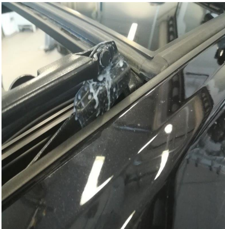
Figure 8. The bracket after lubrication.