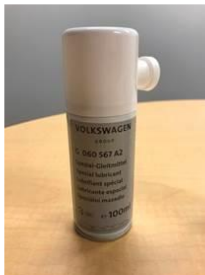
Figure 2. Special lubricant: G 060 567 A2.