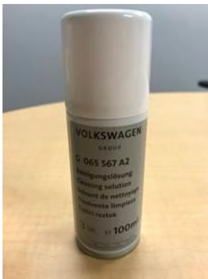
Figure 1. All purpose cleaner: G 065 567 A2.