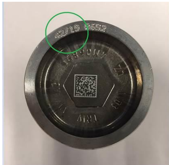
Figure 3. Example of production date after week 36/19.