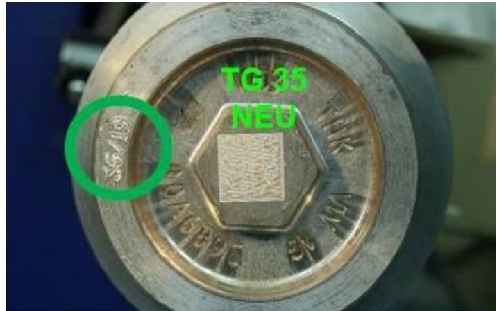
Figure 2. Example of initial production date of week 36/19.

Make sure that the new parts you are installing have production date week 36/19 or later (Figure 1 and 2, green circles).