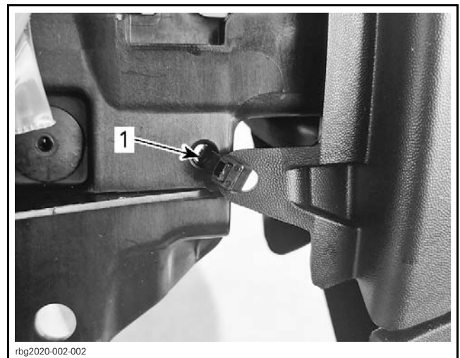
1. Locking tie