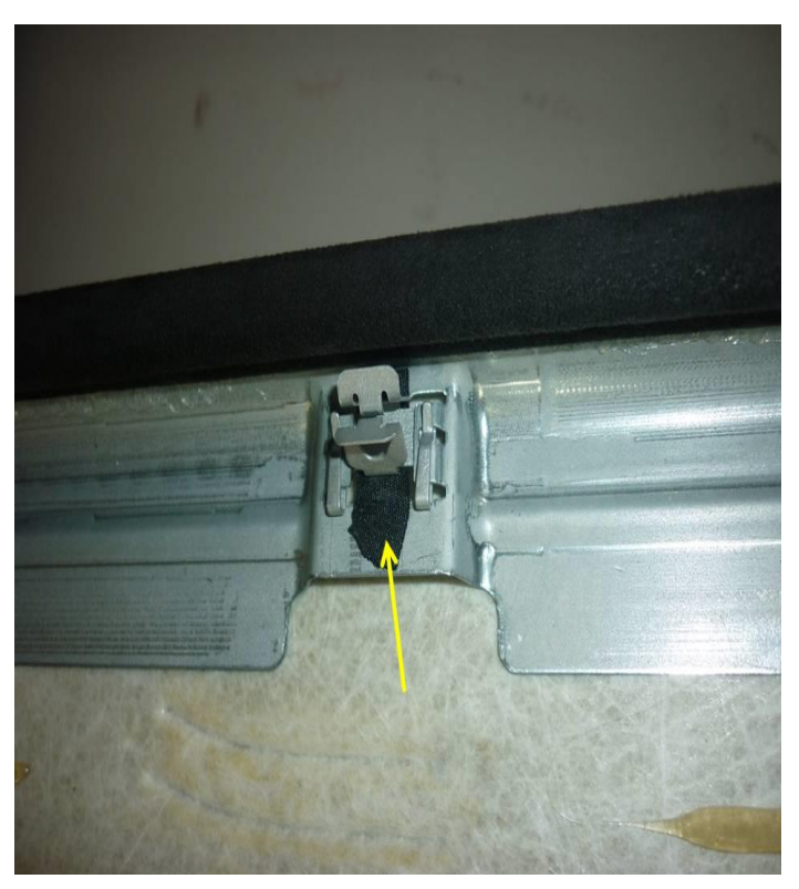
Figure 3. Clips reinstalled.