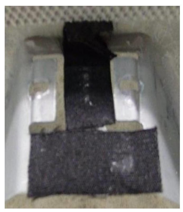
Figure 2. Location of the webbing adhesive tape application.

3. Remove the clips and apply the webbing adhesive tape underneath them, as shown (Figure 2).