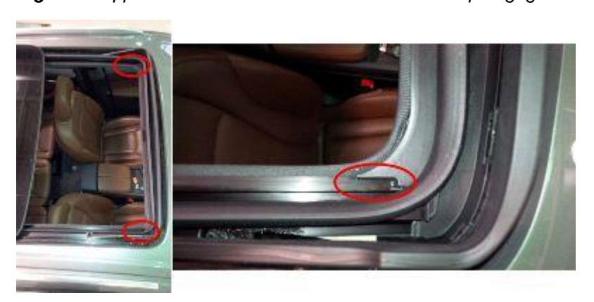
Figure 5. Areas of the sunroof frame to be isolated with webbing adhesive tape.

6. There are two additional points of contact at the front sunroof frame plates that could be a source for noise (Figure 5).