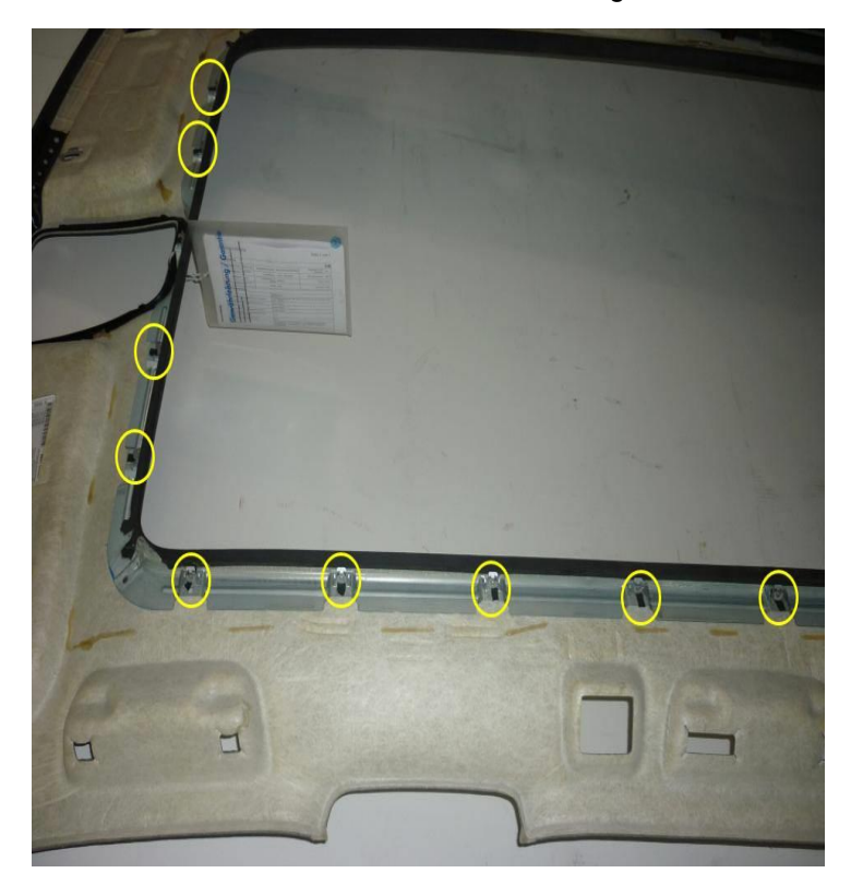
Figure 1. Location of the headliner to sunroof frame clips.