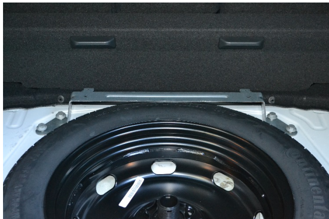
Step 5) Install bracket in front of the spare tire.