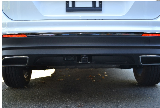
Step 6) Re-install bumper cover and all other trim panels loosened or removed previously.