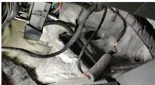
Step 7) Connect the can bus splice connectors located behind glove box near the lower A-pillar.