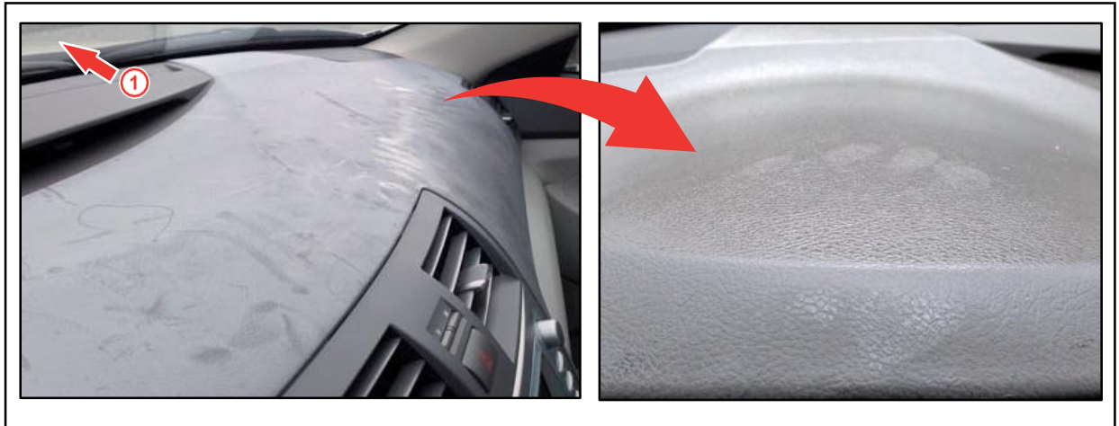
1 Front of Vehicle