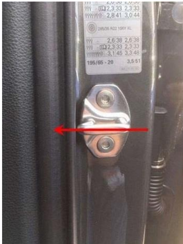
Figure 1. Adjust door striker inward by at least 0.5 mm.