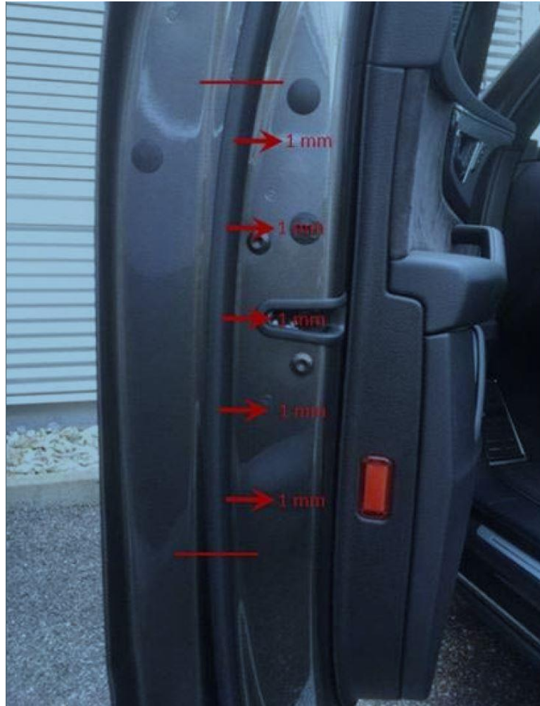
Figure 3. Install the new outer door seal with an inward offset by 1.0 mm.