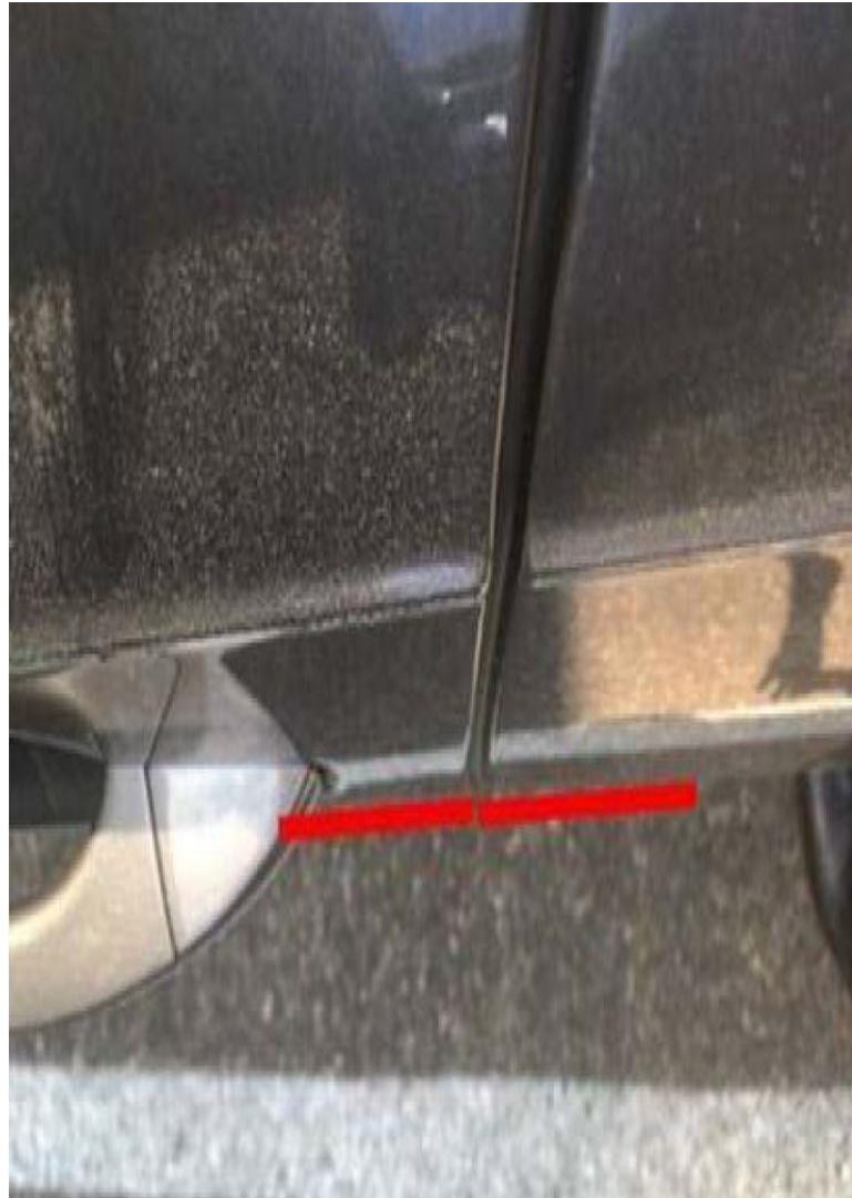
Figure 2. The front door can be flush or slightly underflush to the rear door.