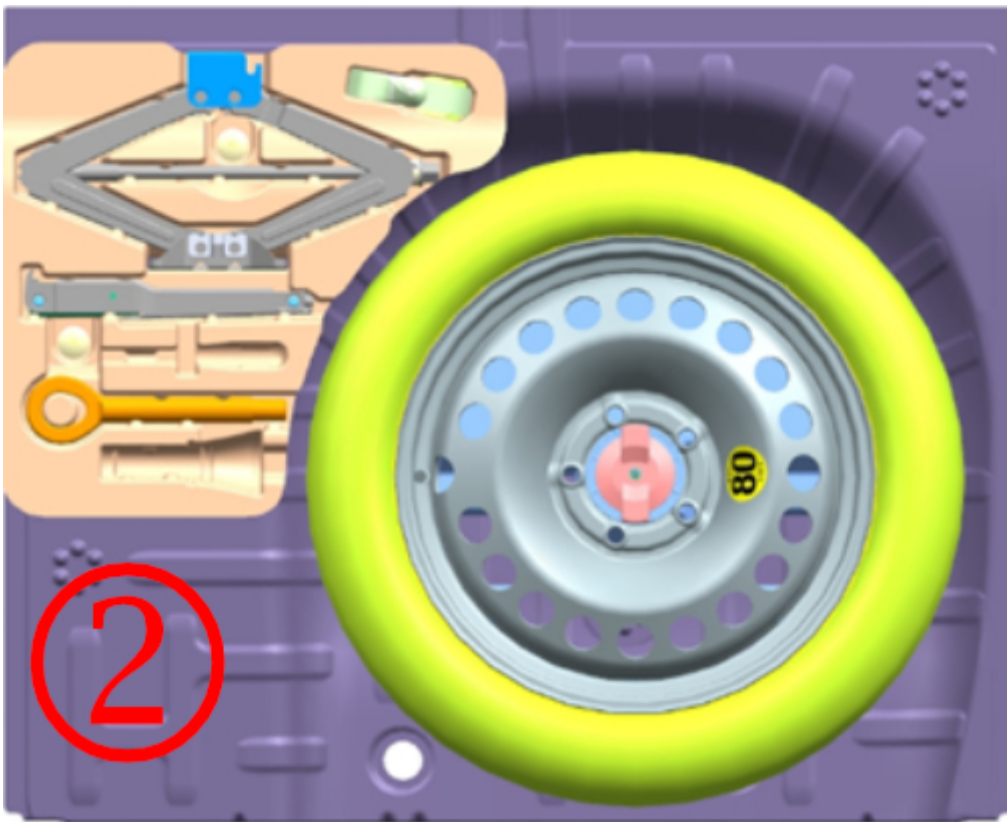
Bose Audio stow beside spare tire