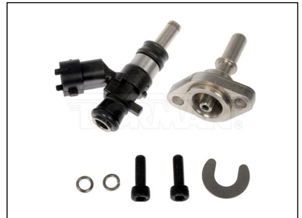
904-7909 and 904-7910