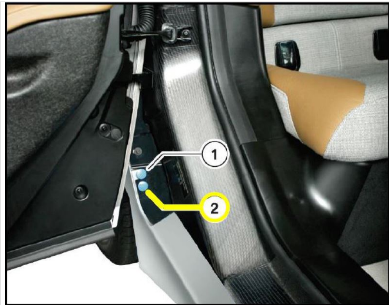
Charging Socket Emergency release (2).

The tensioning strap of the emergency charging socket release has been damaged.