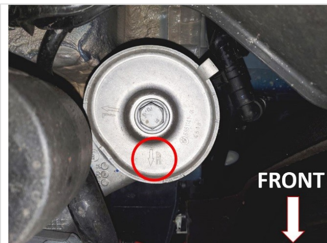
Image shows the rear axle thrust washer on the right side.

Correct positioning: Arrow R (circled) in the direction of travel