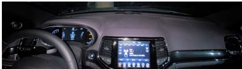
Fig. 2 Entire Width Of IP Cover For Claim Submittal