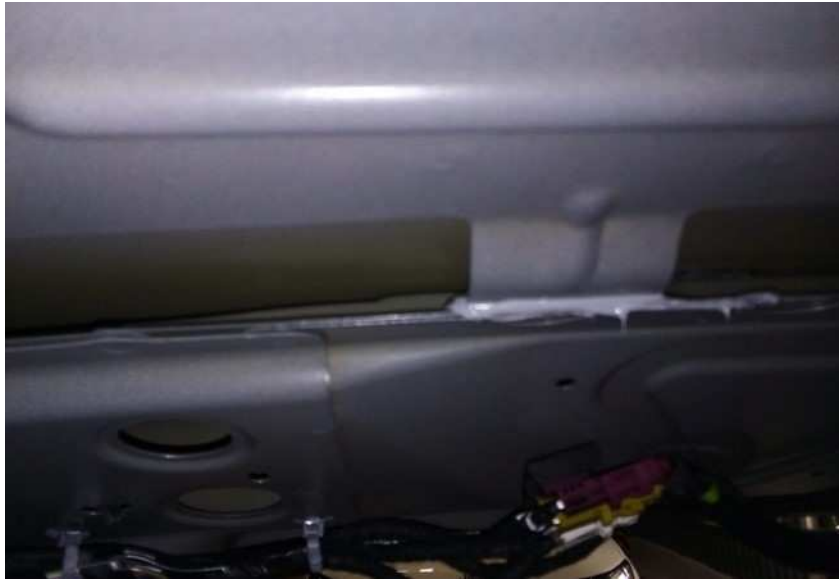
Fig. 3 Sealant Applied To Repair Area