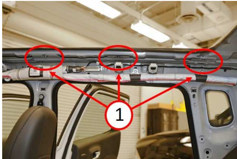
Fig. 1 Areas To Inspect

2. Inspect the B-pillar reinforcement to roof panel for any gap (Fig. 1) .